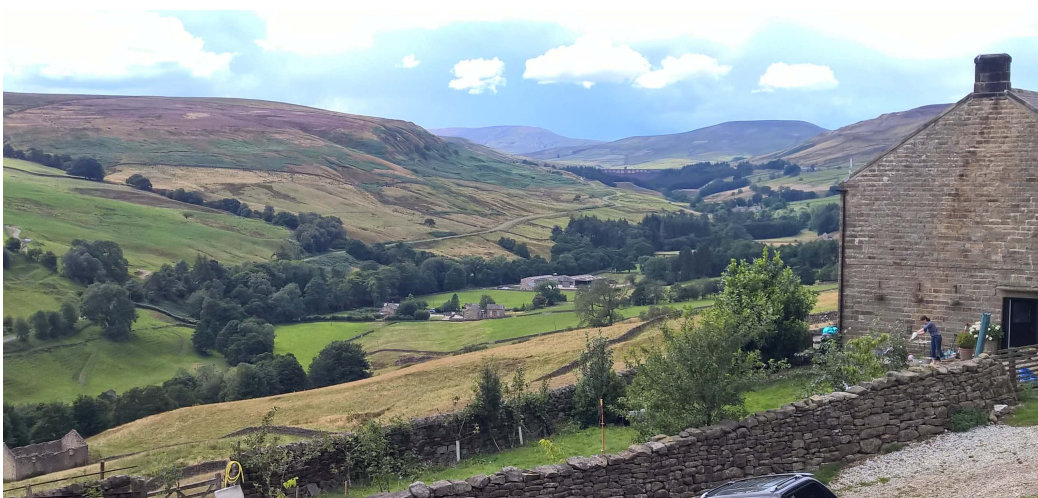
Looking towards the Scar House reservoir, Great (L) and Little Whernside in the distance